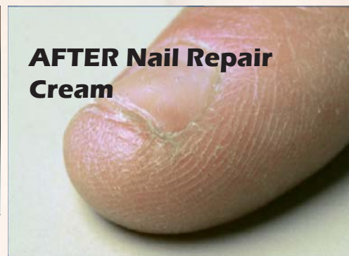
AFTER Nail Repair Cream