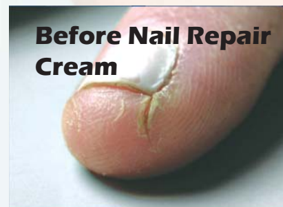
Before Nail Repair Cream

Deficient nails need nutritional and strengthening elements to help them grow. This formula contains all the necessary ingredients to ensure strong, healthy nail growth. (SKU 990309)